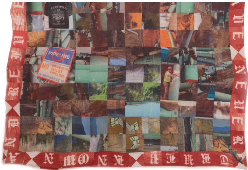
Molly Z.G., manifest destiny , 2021. Courtesy the artist and Institute 193.

In where do we go when we die? Pittsburgh? , Z.G.'s wearable rug features a dark factory building with a flaming smokestack on one side, adjacent to red pitchforks within a fiery desolate land. A cross in the center defines the two spaces and references the historical tradition of painting the biblical scene of The Last Judgement, (the second coming of Christ in which souls are forever stricken to heaven or hell) but here instead of heaven our options are hell or Pittsburgh. Pairing the desolate landscape and factory town hints at the possible impending effects of climate change while the nod to The Last Judgement suggests a personal critique of the mythology of Christianity.