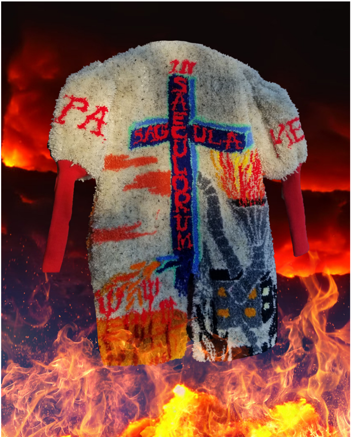
Molly Z.G., Where do we go when we die? Pittsburgh? , 2021. Courtesy the artist and Institute 193.

M olly Z.G.'s solo exhibition Almost Heaven :^) at Institute 193 in Lexington, KY, presents a series of boldly colored hand-made rugs. Patterned with various repeating geometric forms, each rug includes an amalgam of imagery including Christian iconography, pop-culture, and fantasy elements. In addition to