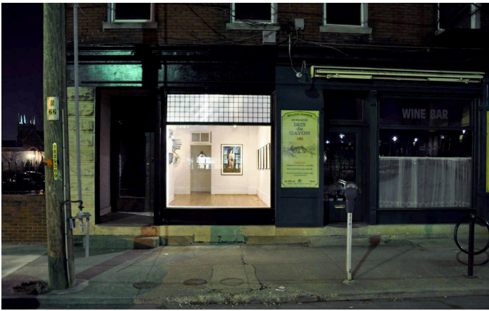
View of facade, Institute 193 in Lexington, KY.