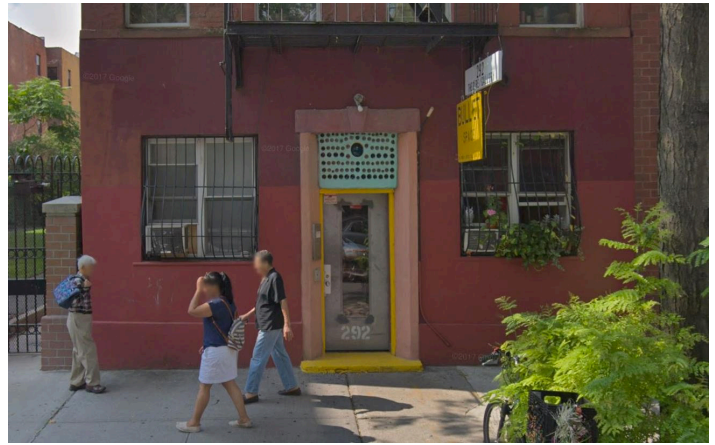
View of facade, Institute 193 in New York City, NY.

LG: That sounds like an interesting backdrop to be in while moving back to Lexington and thinking about the relationship between New York and some of these Midwestern or Southern places. What was on your mind at that time? Or, for you, what was the relationship between New York and these spaces – these parking lots?