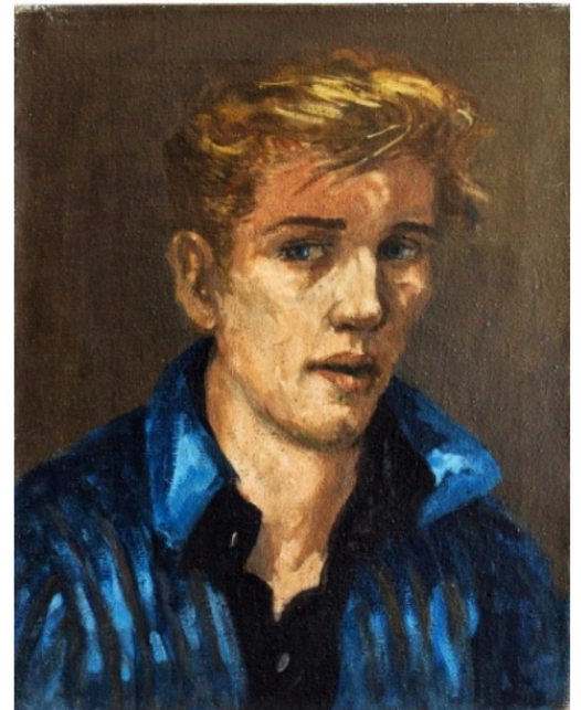
Edward Melcarth, “Portrait of Blond Youth in Turquoise Jacket” (no date), oil on canvas, 20 x 16 inches, The Forbes Collection

His masterwork here, though, is his “Last Supper,” in which the old Christian story is set at the counter of a diner. In this long, horizontal composition, the arms of handsome men reach out in a tussle to grab doughnuts or touch a muscled server — who just might be the figure of Jesus Christ with his face turned away — in counterpoint to shafts of light piercing the narrow space they all occupy. Where is Judas? Is he the fellow in a white cap, seen from