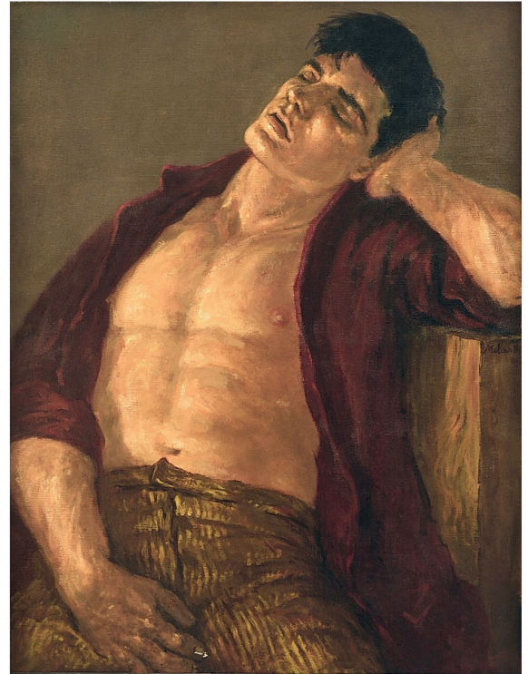
Edward Melcarth, "Junkie with Open Shirt" (no date), oil on canvas, 40.5 x 30.25 inches, The Forbes Collection

Perhaps the transgression that most likely explains Melcarth's exclusion from the abstraction-focused art history of his time was the fact that he was an avid figurative painter — an enthusiastic depicter of the male face and body, subjects he often eroticized in compositions whose structures can appear as sophisticated and dynamic as