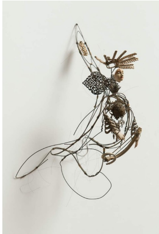
"First Guardian Angel"

It was poignant, because as we looked at the portraits, we realized that he was about to turn 27, which was my age when I found out I had HIV in 1987. And I had saved this body of work [of photographs] and waited for the opportunity to show them with a sense of the consciousness that I felt they held. So we decided to do an exhibition of them at 193 in Kentucky, which we did last year, but that then we would do a larger scope of my work in a book.