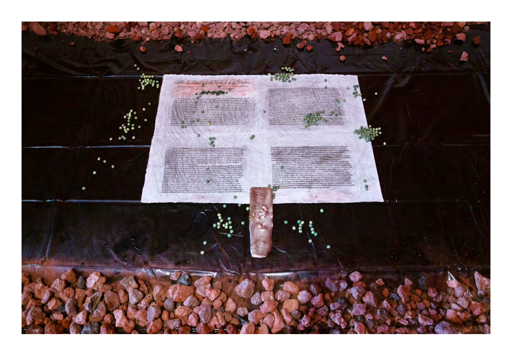
Porcelain Plates Hold Cyborg Supper Or The Two-Dimensional Door Through The Loop At The End Of My Rope Bronze, ceramics, acrylic, ink and silverpoint on paper Dimensions variable 2019