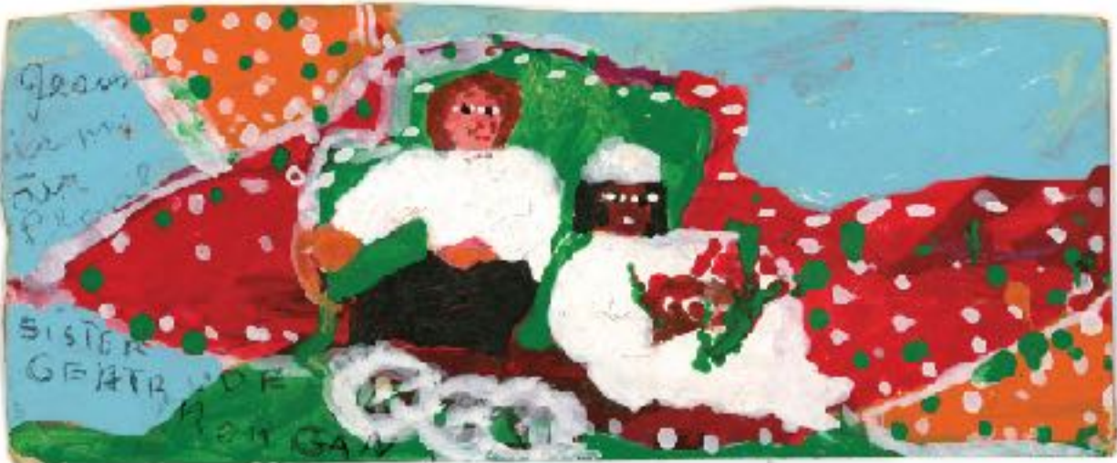
Sister Gertrude Morgan, Jesus is My Airplane , 1974. Tempera and ballpoint pen on paperboard, 3.5 x 9 inches. Private collection

Mendes was rightfully captivated by Sister Gertrude's colorful artworks, which prophesied about the coming of new Jerusalem. She depicted streets paved with gold and tall modern apartments filled with happy people, including Sister Gertrude herself and Jesus.