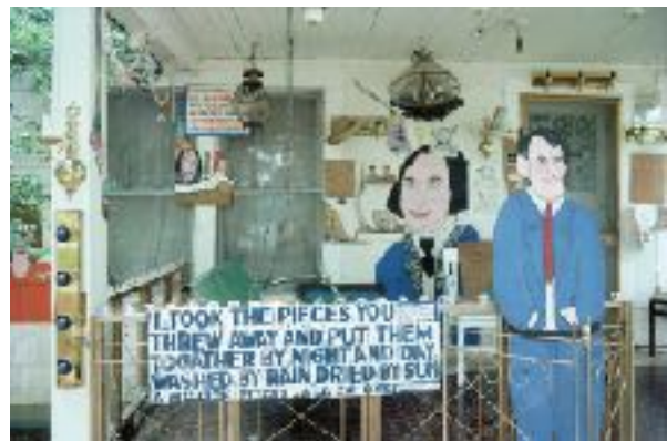
Howard Finster's Paradise Garden (Summerville, Georgia), 1987-88