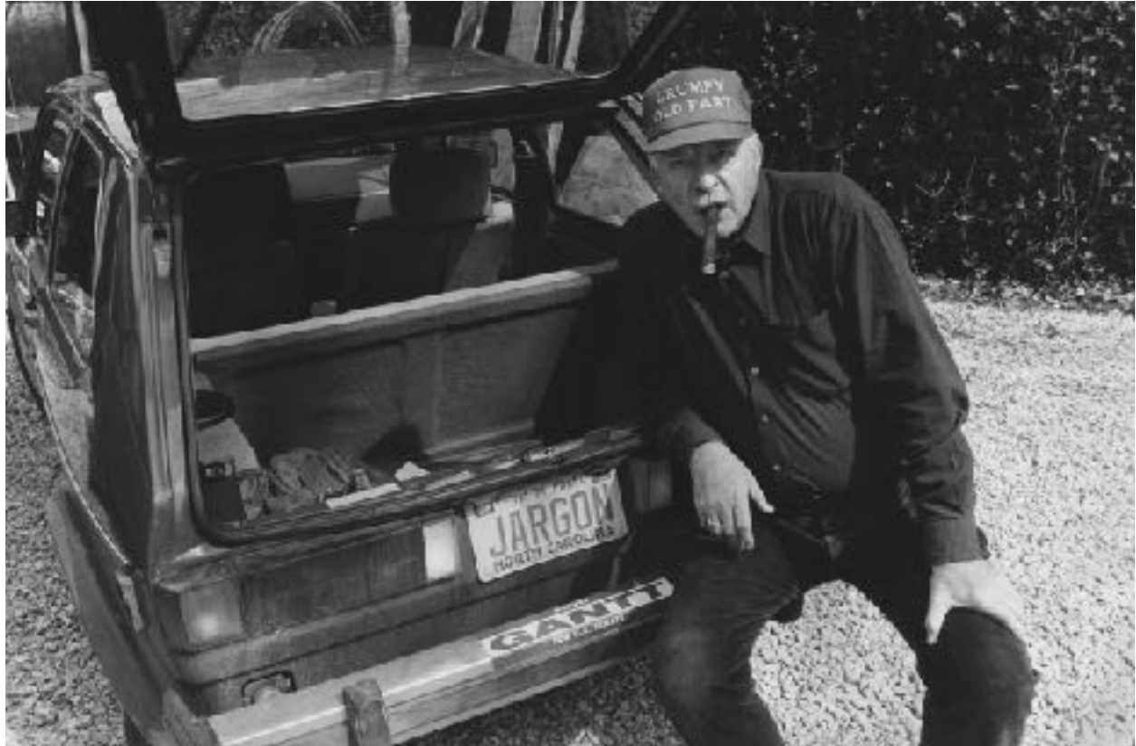
Jonathan Williams and Okra the VW (Highlands, North Carolina), 1986.

So who was Jonathan Williams, my neighbor?