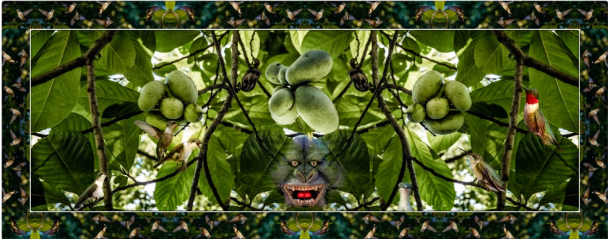
Melissa Watt, Monkey in the Pawpaws , 2019, composite photograph, 18.5 x 47 inches

Art is therapy. Mind you, it's not a cure for what ails this world, but its mere existence can sometimes soften the rough edges of our tempestuous climate.