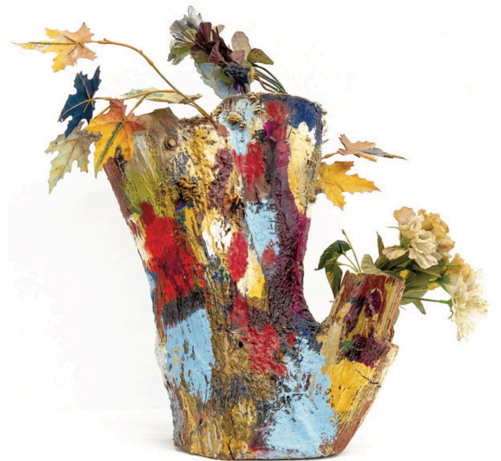
Untitled, 1980s, mixed media 22 x 20 x 11 in. / 59 x 56 x 28 cm, The Arnett Collection

In time, Williams began making large, painted-wood cutout figures of comic-book superheroes, which he displayed in the yard of his home. He produced mixed-media assemblages, including a one-person vehicle, and numerous, sculptural pencil holders, some of which resemble familiar objects. (One of them cleverly takes the shape of a missile poised for launch.)