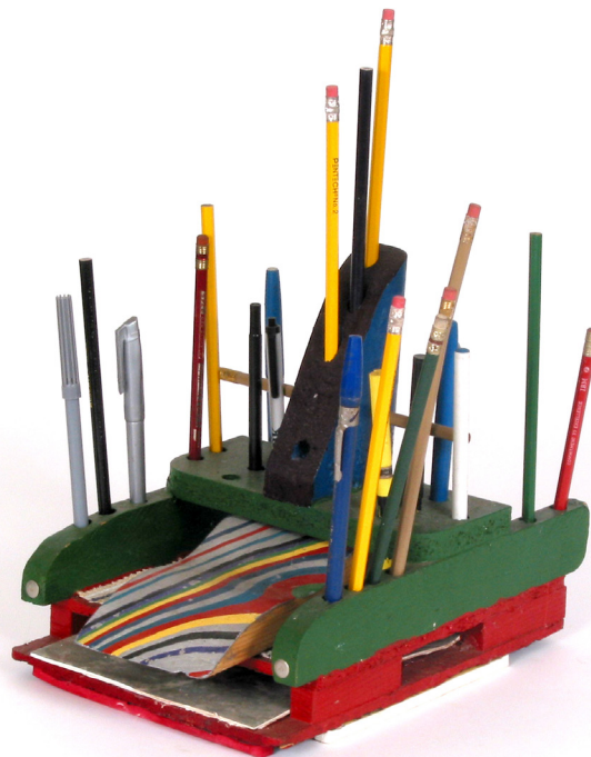
Pencil Holder , c. 1997, mixed media, 14 x 12 x 9 in. / 35 x 30 x 23 cm, Kentucky Folk Art Center, Morehead State University