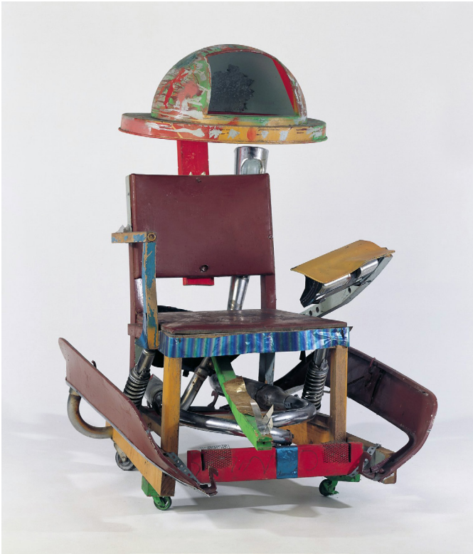
Fantasy Automobile , early 1980s, mixed media, 51.5 x 38 x 43 in. / 130 x 97 x 109 cm, Souls Grown Deep Foundation

Examining such themes as women's liberation, racism and black power, and environmentalism, Williams wrote and illustrated his own comics and created original characters: the Amazing Spectacular Captain Soul Superstar, Black Son, and J.C. of the Job Corps. In his Cosmic Giggles series, Martians visiting Earth decide not to establish a terrestrial colony, given all the racism, sexism, environmental pollution and social problems human beings had managed to cook up.