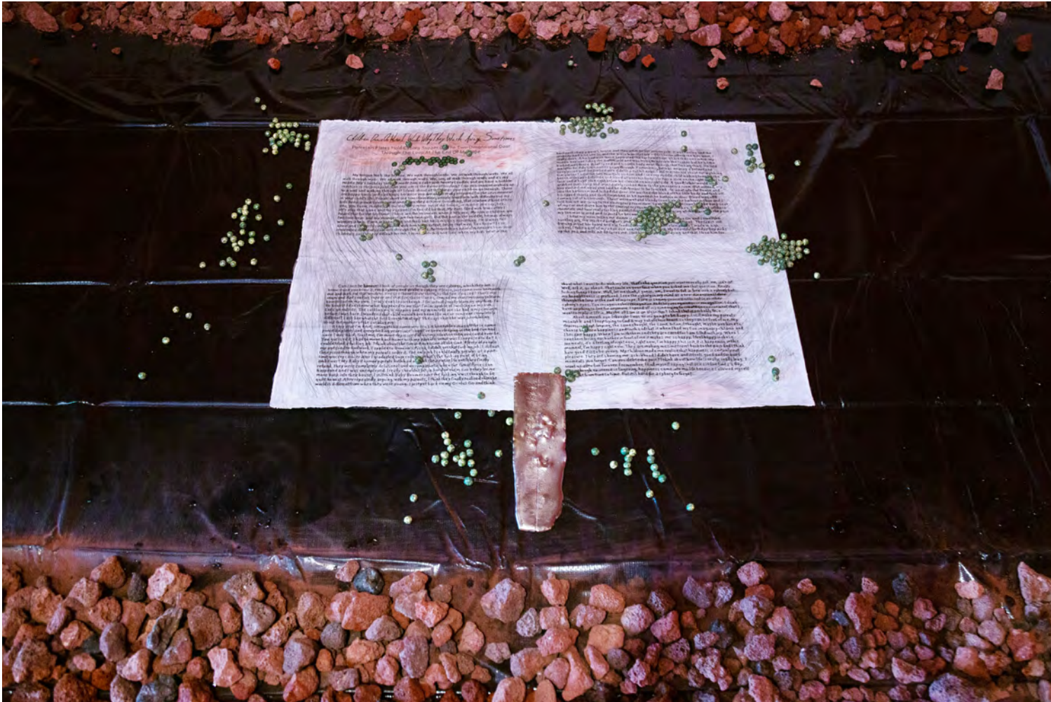
Porcelain Plates Hold Cyborg Supper Or The Two-Dimensional Door Through The Loop At The End Of My Rope Bronze, ceramics, acrylic, ink and silverpoint on paper Dimensions variable 2019